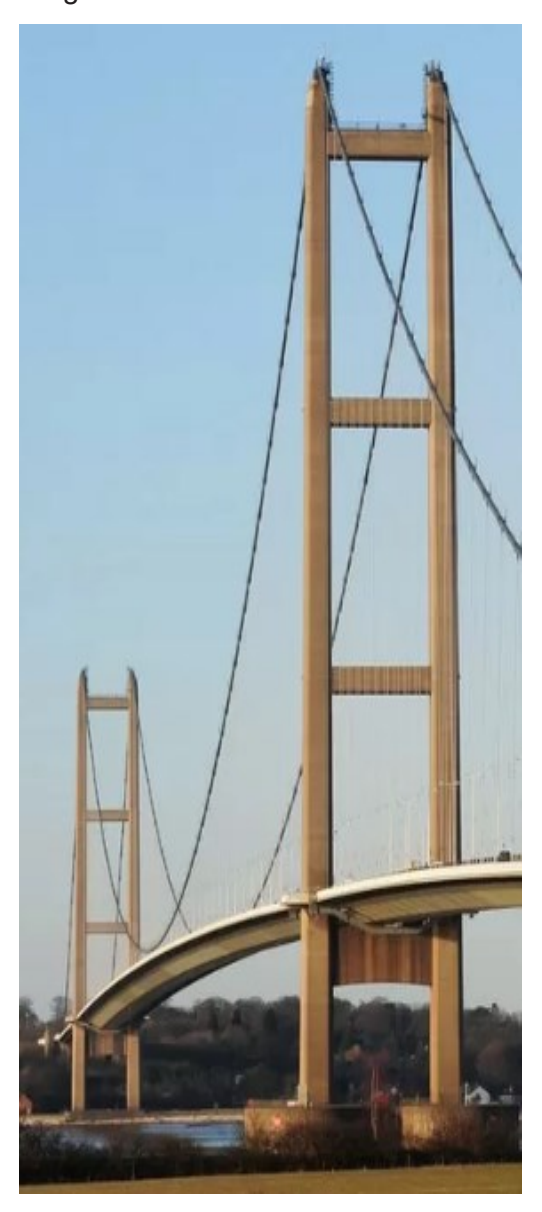
The Humber Bridge, the gateway to Hull. Opened in 1981 by HM Queen Elizabeth II. It held the world record for the longest single span until 1998.

The Department is excited to welcome the EIG to Hull in 2024 and hope to engage new students in the diverse range of extractive industries.